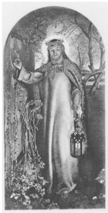
The Light of the World William Holman Hunt's 1853 painting given to Keble College, Oxford.